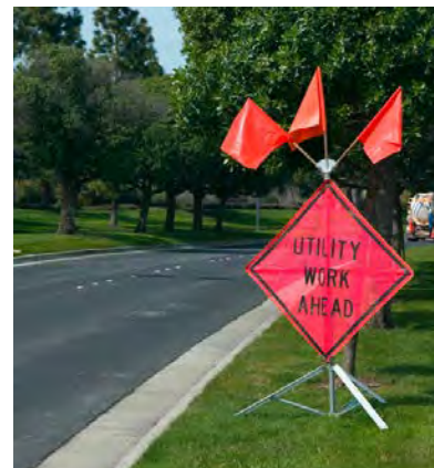
UTILITY CUT REPAIRS

PROVEN MOST DURABLE BY FEDERAL HIGHWAY TESTING*