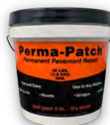
30 LB REGULAR MIX PAIL PP-30-CP