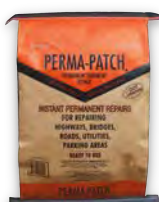
60 LB REGULAR MIX BAG PP-60-C