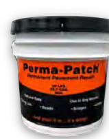
50 LB REGULAR MIX PAIL PP-50-CP