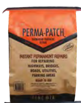
60 LB FINE MIX BAG PP-60-F