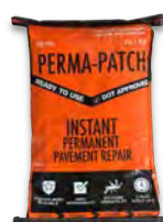
50 LB REGULAR MIX BAG PP-50-PLC