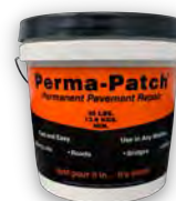
30 LB FINE MIX PAIL PP-30-FP