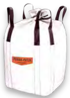
1 TON REGULAR MIX BULK BAG PP-2000-BC