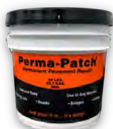
50 LB FINE MIX PAIL PP-50-FP