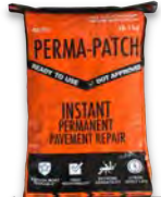
40 LB REGULAR MIX BAG PP-40-PLC