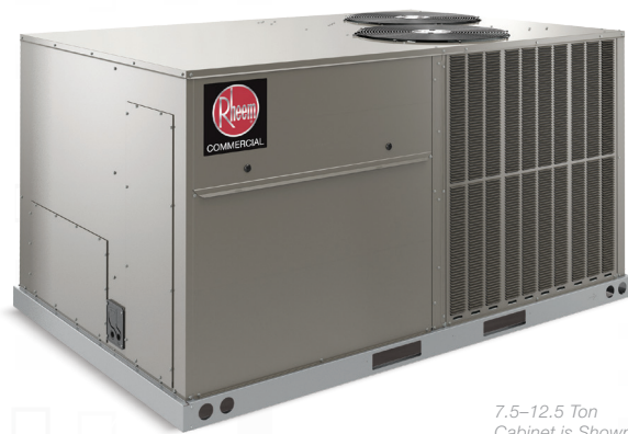
7.5-12.5 Ton Cabinet is Shown

:: customized solutions to help grow your business.