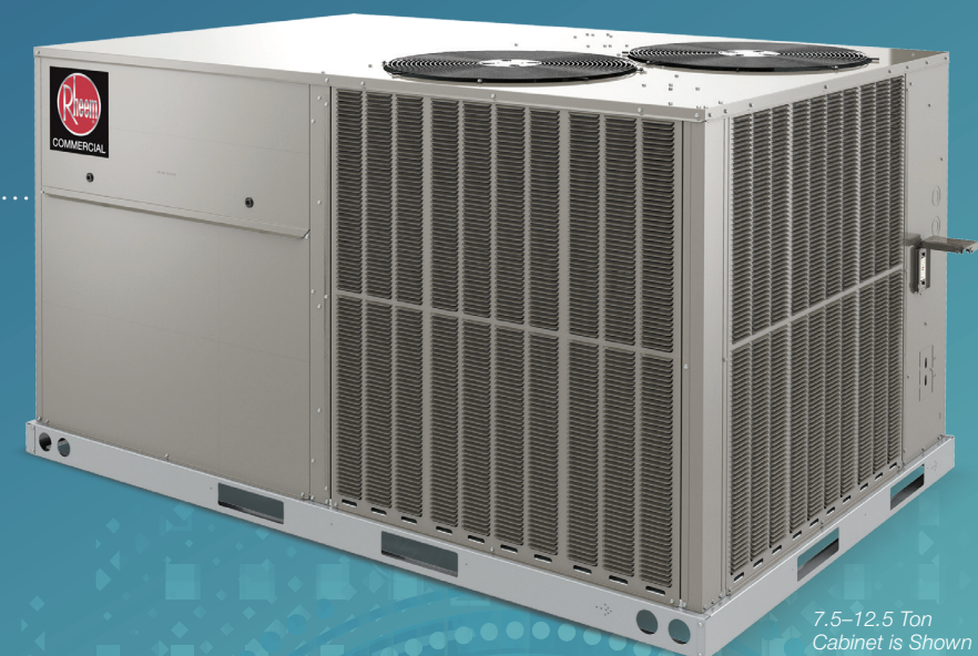
7.5–12.5 Ton Cabinet is Shown

With industry-leading efficiencies of up to 14.8 IEER, the Renaissance Line may qualify for a variety of utility rebates—helping business customers realize substantial savings for a greater return on their investment, at purchase and year after year.