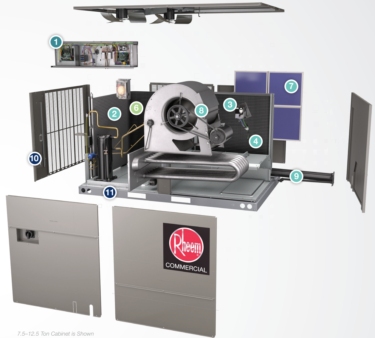
7.5–12.5 Ton Cabinet is Shown