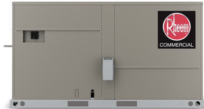
7.5–12.5 Ton Cabinet is Shown

Based on inspired thinking and innovative problem solving— a refined solution to enhance productivity.