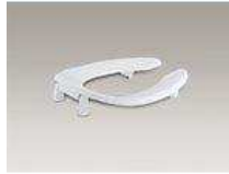
Elongated toilet seat with 1" bumpers and anti-microbial agent K-4679-CA-0