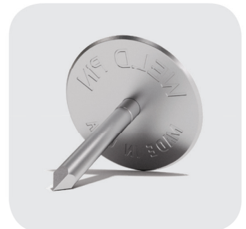
PowerPoint Weld Pins are manufactured in the USA to international quality standards.

PowerPoint Weld Pins save time and money because they perform consistently. Each point is precisely formed to provide optimum weld current and each cap and shank assembly is securely swaged and centered so that pins will feed without jamming, even in older welders. In addition, PowerPoint Weld Pins may be shipped in plastic buckets to eliminate shipping damage. The result is continuous production without the expense of clearing track jams or refastening where other pins fail.