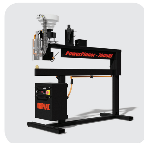
For peak performance, it is highly recommended using Gripnail's wide range of PowerPinner welders.