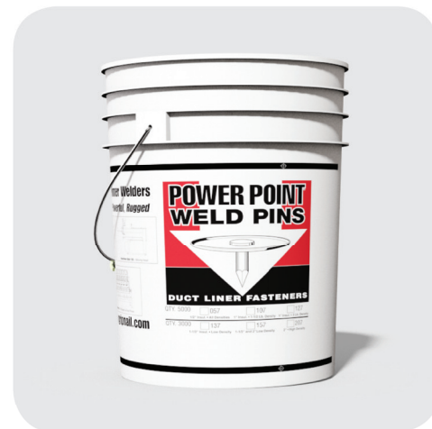
PowerPoint Weld Pins are shipped in plastic buckets to eliminate shipping damage.