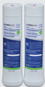
Pre- & Post-Filter NSROPF