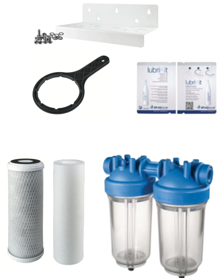
DP Big PET Housing Metal Powder-coated White Bracket Filter Wrench Lubricant