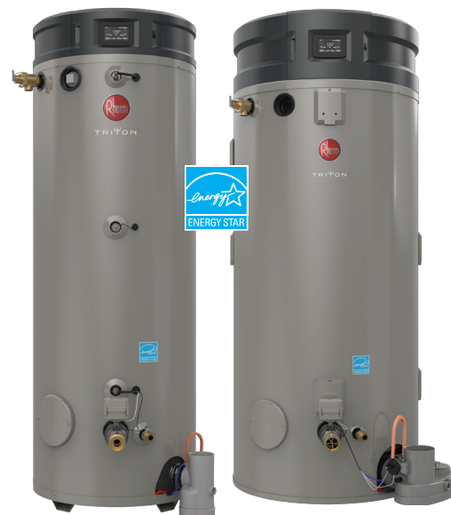
Triton SS 80 & 100-Gallon

**2.4 GHz WIFI broadband Internet connection required.