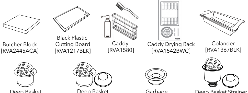
Deep Basket Disposal Flange [RVA1049ST/BL/GG]