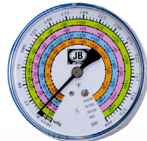
M2-400 4" Illuminating, Class 1, 1%