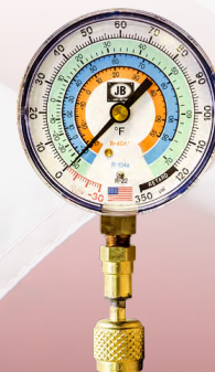
QC-G851 3-1/8" Single Test, Standard