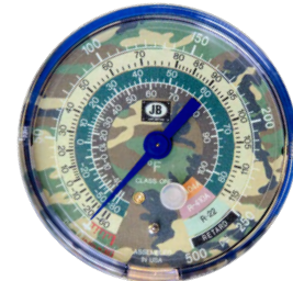
M2-924CM 3-1/8" Illuminating, Class 1, 1%