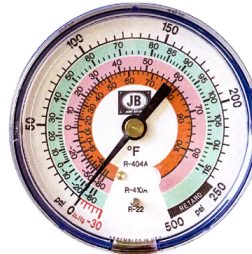
M2-820 3-1/8" Illuminating, Standard