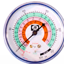
M2-460 2-1/2" Non-illuminating, Standard