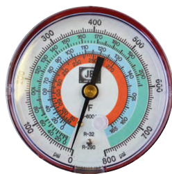
M2-605 Pressure 3-1/8" Illuminating, Class 1, 1%