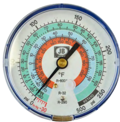
M2-600 Compound 3-1/8" Illuminating, Class 1, 1%