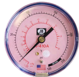
M2-810 (R410A Only) 3-1/8" Non-illuminating, Standard