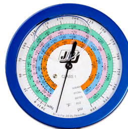
M2-860 3-1/8" Liquid Filled, Class 1, 1%