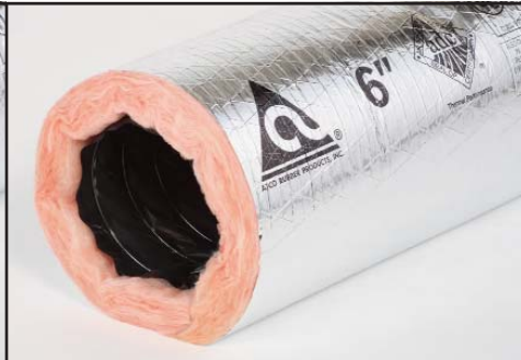
UPC #036 R-Value 6.0