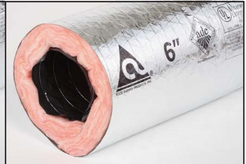
UPC #031 R-Value 8.0

All thermal performance (R-Values) are classified by Underwriters Laboratories in accordance with ADC Flexible Duct Performance and Installation Standard (1991) using ASTM C-518 (1991), at installed wall thickness, on flat insulation only.