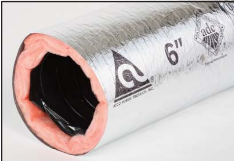
UPC #030 R-Value 4.2