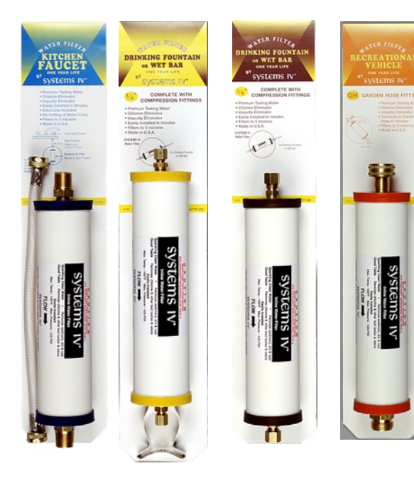
T6 T10 T10P