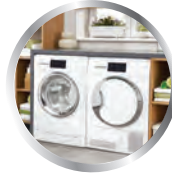
Commercial Laundering Approved