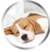
Blocks Pet Dander