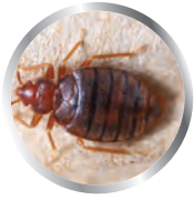
100% Bed Bug Proof

Preemptive Zippered Box Spring Encasement