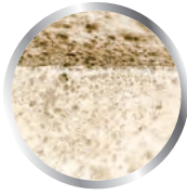
Blocks Mold Spores