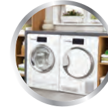
Commercial Laundering Approved