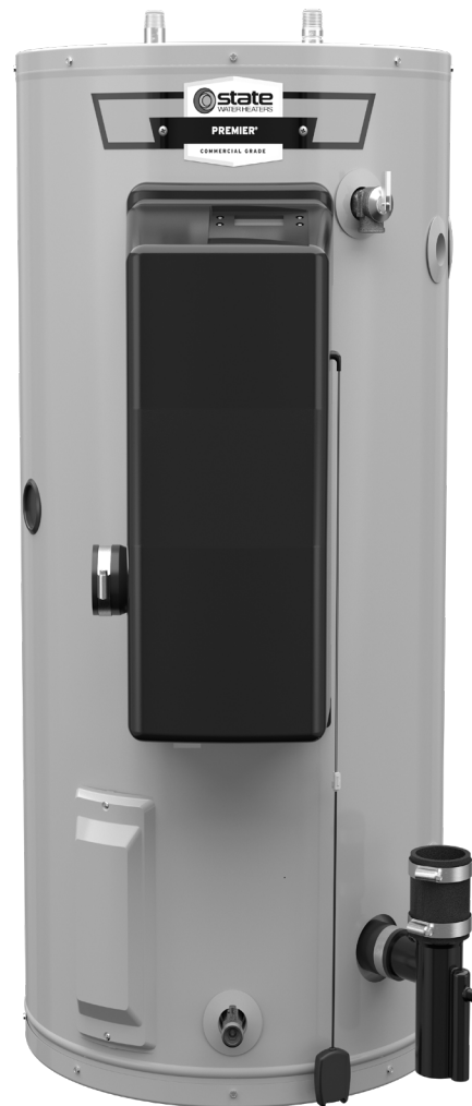
MODEL SHOWN GP8-40-YRPCSL

*Continuous hot water based on 65,000 BTU unit, 2.8 GPM continuous flow with a 65°F inlet water temperature, 110°F outlet temperature, and a unit installed per the manufacturer's instructions.