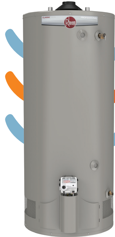
Professional Classic Heavy Duty Ultra Low NOx 75 and 98-Gallon Capacities 75,100 BTU/h Natural Gas