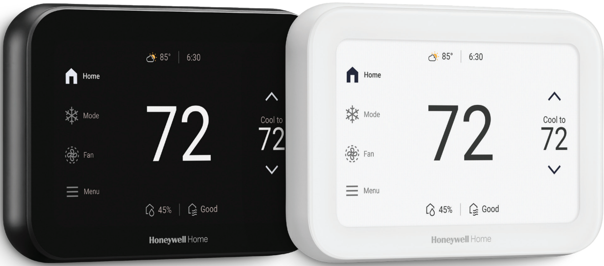
ELITEPRO™ S1100 SMART THERMOSTAT THX1100W3/U - WHITE THX1100B4/U - BLACK