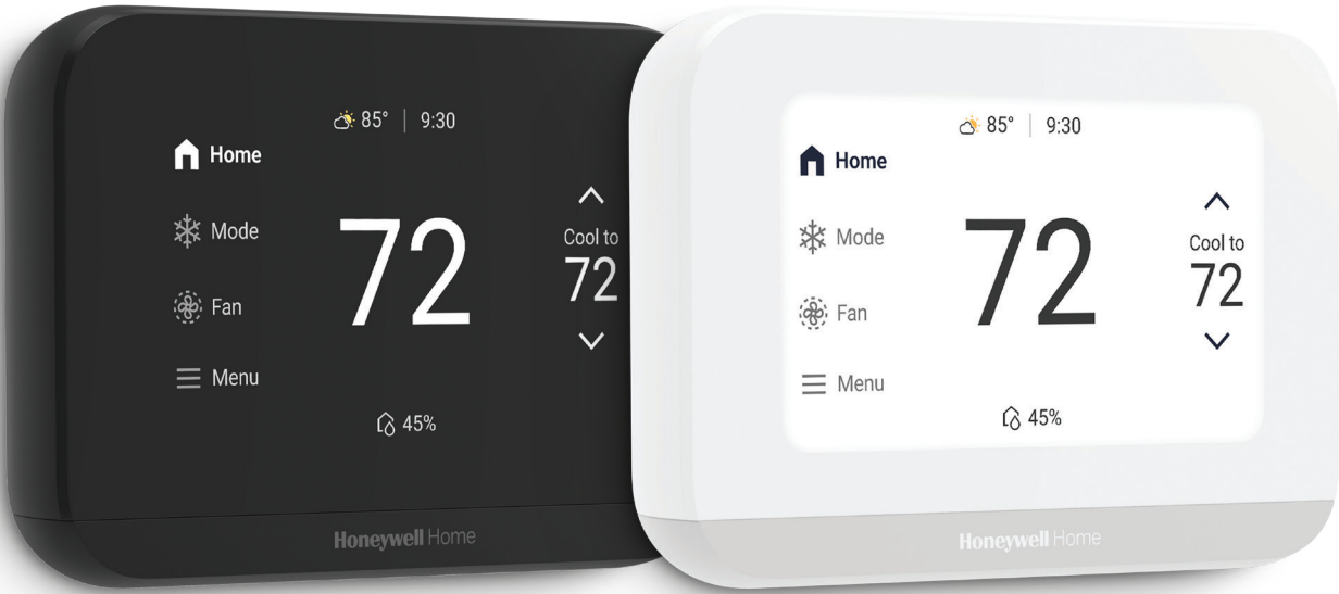
ELITEPRO™ S900 SMART THERMOSTAT THX900W1/U - WHITE THX900B2/U - BLACK