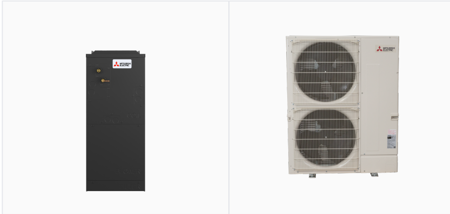
INDOOR Unit ... SVZ-AP60NL OUTDOOR Unit ... SUZ-AK60NL