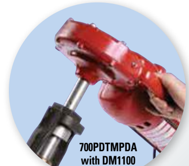
700PDTMPDA with DM1100