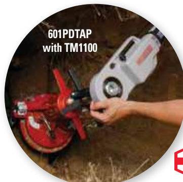
601PDTAP with TM1100