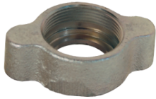
Plated iron / steel