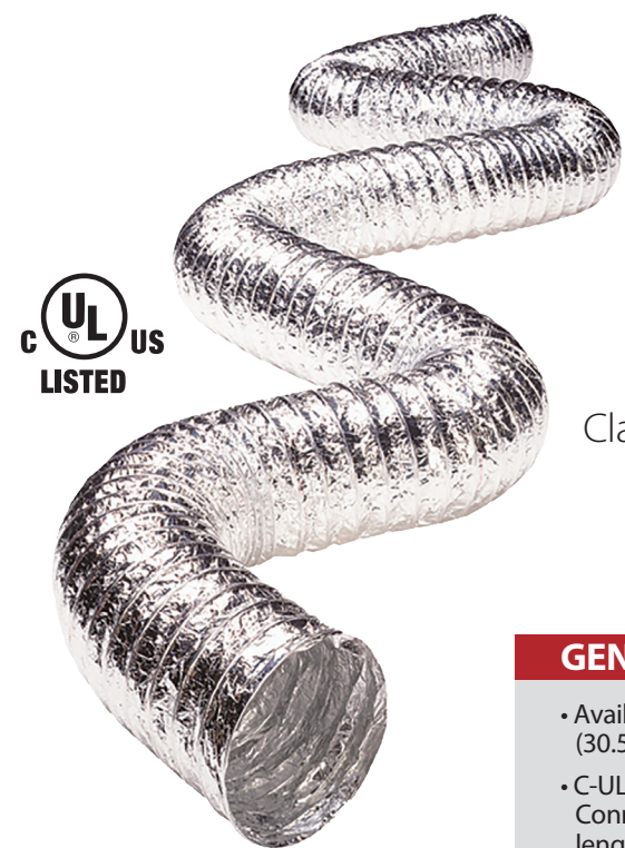
Class 1 Air Connector