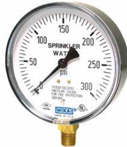
Bourdon Tube Pressure Gauge Type 111.10SP

Additional error when temperature changes from reference temperature of 68°F (20°C) ±0.4% of span for every 18°F (10°K) rising or falling.