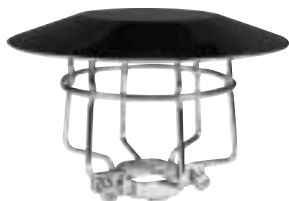
V27 Intermediate Upright Guard

The Models V27 and V34 Sprinkler Guards are designed to protect the sprinkler from mechanical damage. Each guard is constructed from chrome plated steel wire welded to steel plates.