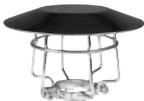
V34 Intermediate Upright Guard