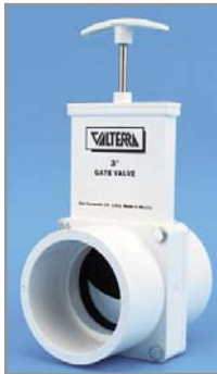
VSGV 3 piece body