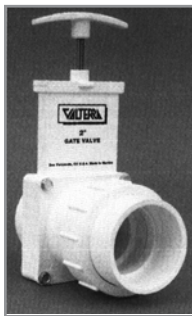
VSGV 3 piece body with union