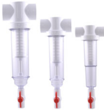
NT SO Series