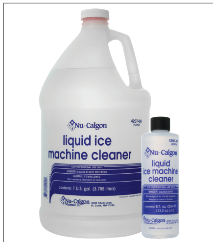
Liquid Ice Machine Cleaner