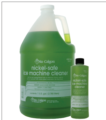
Nickel-Safe Ice Machine Cleaner

Nickel-Safe Ice Machine Cleaner is a specially formulated citric/phosphoric food-grade product for removing scale deposits from ice makers having nickel-plated or tin-plated evaporators. It is acceptable for use in machines made by Manitowoc and other manufacturers using nickel. In fact, it was the industry's first nickel-safe product, introduced in collaboration with Manitowoc. Usage rate should be in accordance with the manufacturers instructions or 16 fluid ounces with three gallons of system water.