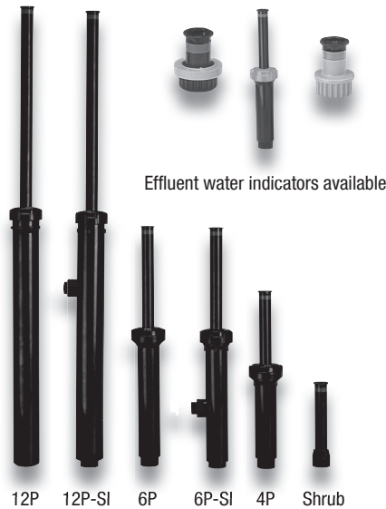
Effluent water indicators available