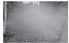
Without pressure regulator

Note: You must have a nozzle screen or flush plug in place to deactivate the X-Flow® function. Without either, there will not be flow through the sprinkler.