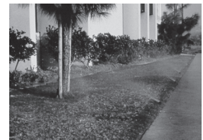
With pressure regulator