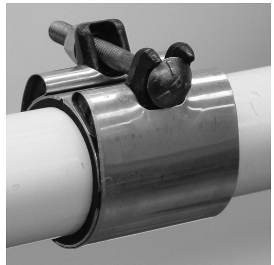
230 SERIES CLAMP