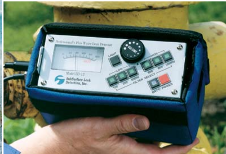
Ground Miking with the LD-12 to Pinpoint the Leak