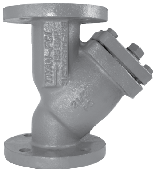
2 1/2" YS 58-CI