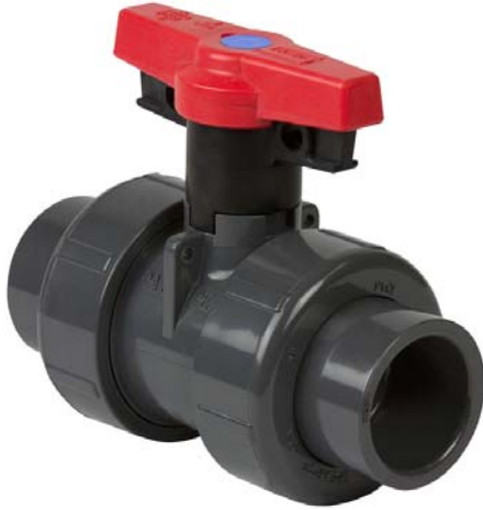
True Union 2000 Industrial Ball Valve

Spears® True Union 2000 Ball Valves, 3-Way Ball Valves and Ball Check Valves provide maximum versatility with fully interchangeable valve cartridges. Provides for easier system design modifications and upgrades in multiphase projects, or anywhere changes in valve types are desired. Simply exchange any True Union 2000 valve in-line using existing union nuts. Also mates with Spears® new 2000 Pipe Unions. All True Union 2000 valves feature a low profile, compact design for minimal space requirements. Additionally, Spears® offers valve Retrofit Kits for easy in-line replacement of other valves and factory installed Actuation Packages.