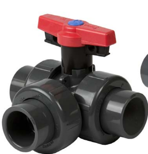
True Union 2000 Industrial 3-Way Horizontal Diverter Ball Valve & 3-Way Full Port Ball Valve with Branch shut-Off