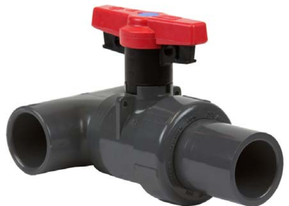
True Union 2000 Industrial Tee-Style Ball Valve