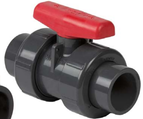
True Union 2000 Standard Ball Valve