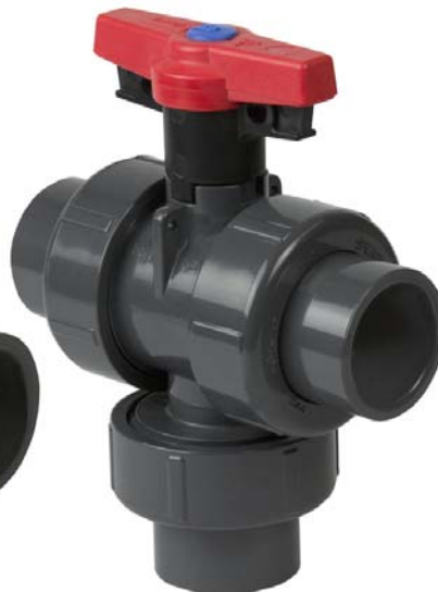
True Union 2000 Industrial 3-Way Vertical Ball Valve & 3-Way Full Port Ball Valve with Branch shut-Off