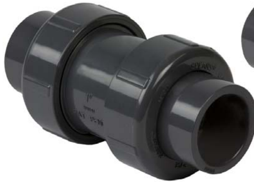
True Union 2000 Industrial Ball Check Valve