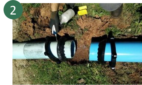
2 Lubricate pipe and gasket with soap/water solution and begin installation by placing one gland and one fully lubricated gasket over each pipe end.