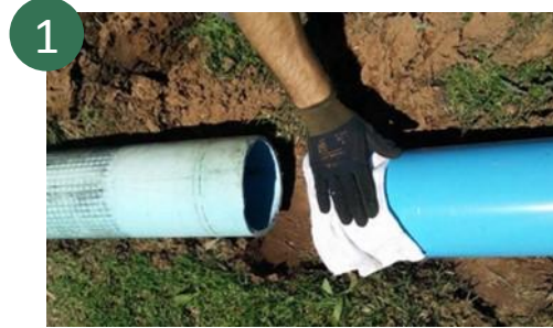
1 Thoroughly clean the pipe where the coupling will be installed.