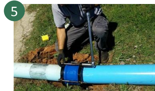
5 Recheck torque after line pressurization.

* Deflection of up to 4° per side is allowed