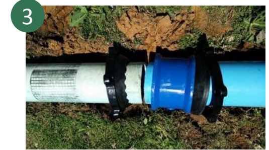
3 Position the center barrel over the pipe (position barrel within the two reference marks) and attach gasket & gland assembly at both ends of the center barrel.

Note: Maintain a recommended gap between pipe ends of 1/4" to 1/2" for 7" sleeve and 1/2" to 1 1/4" for 10" sleeve when centering coupling over pipes ends.