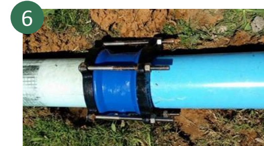
6 Pressure test all joints before covering coupling.