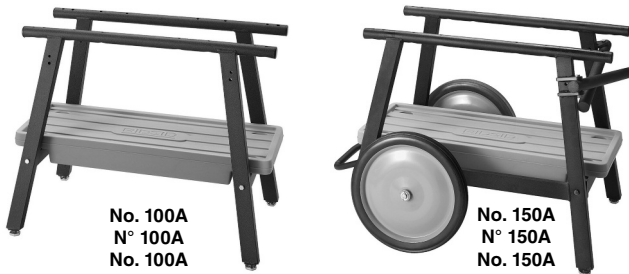
Figure 1 – RIDGID 100A and 150A Stands

See the product label for specifications or consult the RIDGID catalog.