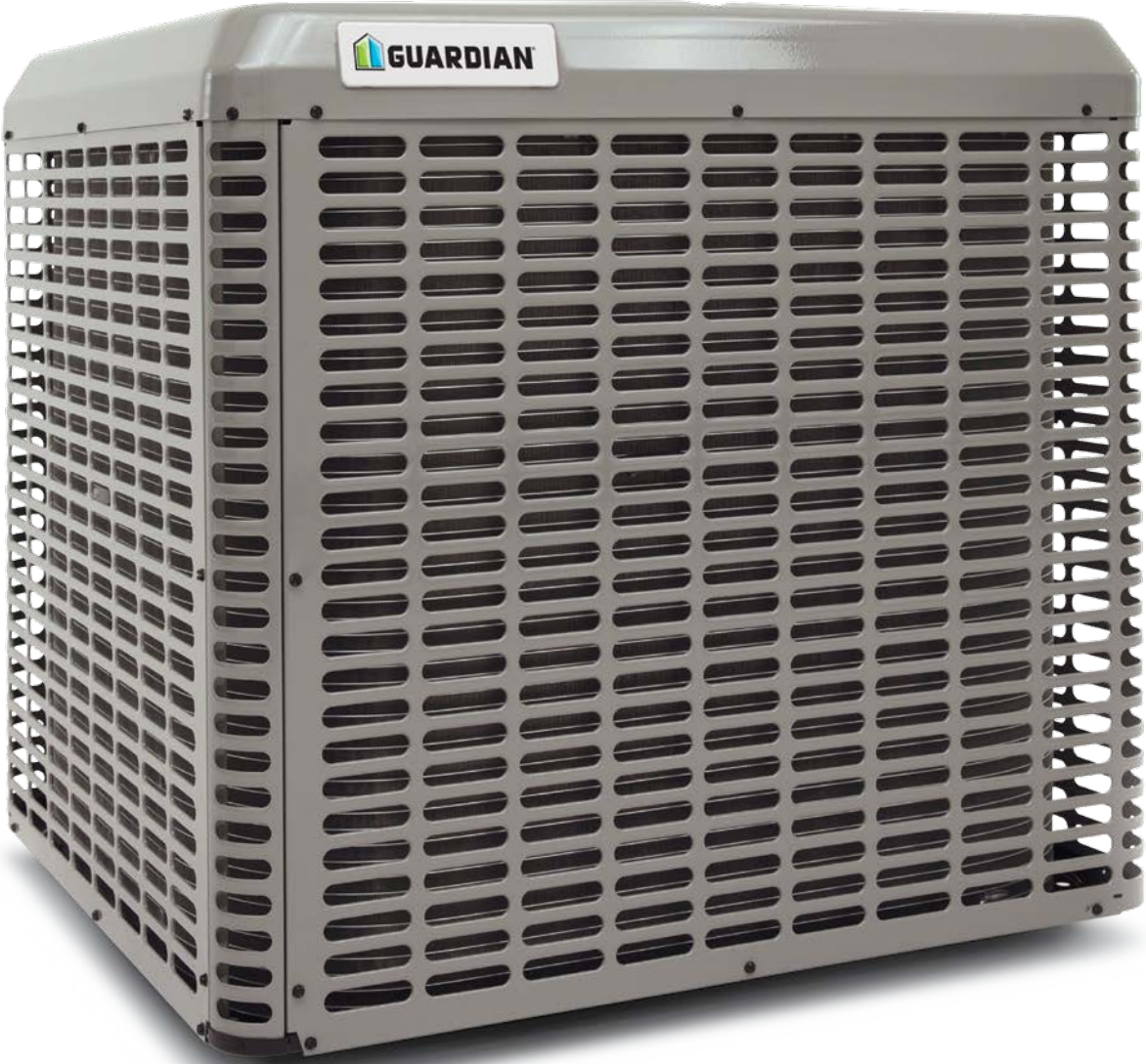
Guardian® QH4/RHP Series Heat Pumps come with a small footprint and reliable operation.