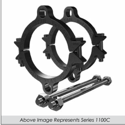
Above Image Represents Series 1100C

1000C & 1100C For Use On Ductile Iron Pipe