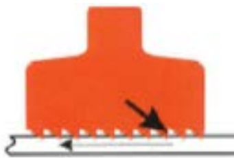
Cross Section of PV-LOK illustrates directional grip of serrations to maximize restraint of PVC pipe

The PV-LOK™ Series PWP restrainer incorporates a series of machined serrations that effectively engage PVC pipe walls, to provide positive joint security and full support of the pipe. The directional gripping action maximizes restraint during increased line pressures such as those resulting from surges and water hammers. The Series PWP incorporates two PV-LOK clamping rings and a series of restraining rods & nuts that tie the two rings together and secure the PVC bell and spigot pipe joint.