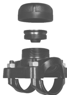
Mechanical Joint Fitting