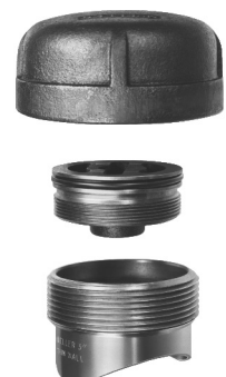
Thin Wall Fitting