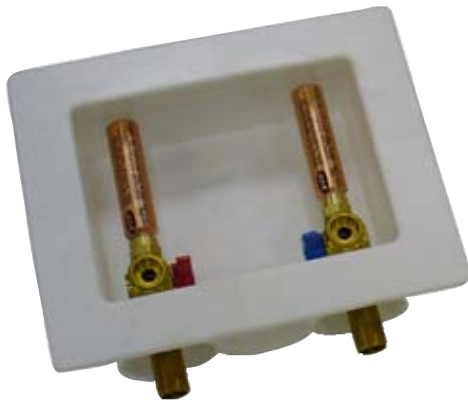
Plastic Laundry Box MM-500PLB

Precision Plumbing Products has designed a plastic/metal laundry box assembly that makes your installation simple and cost effective. Solenoid operated laundry equipment can create destructive water hammer due to quick closing valves on the fill cycle. Water hammer can damage or even break your hose connections as well as destroy the solenoid valve. To avoid this common household problem hook your washing machine hose connectors to the quarter turn ball valve in our laundry box assembly with water hammer arrestors and rest easy.