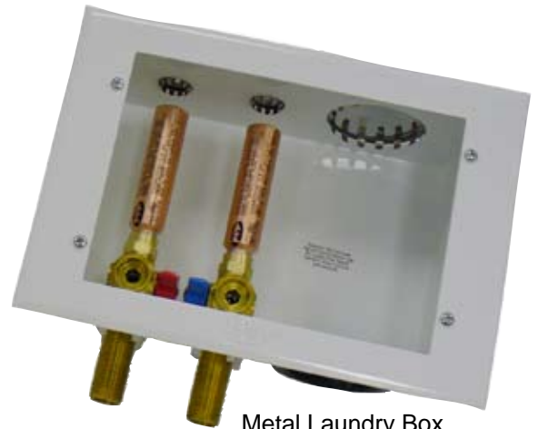
Metal Laundry Box MM-500MLB