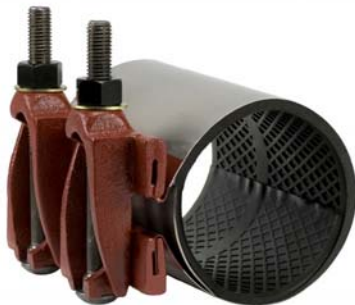
JCM 101 Universal Clamp Coupling Image reflects 6" width

JCM 100 Series Universal Clamp Couplings meet or exceed ANSI/AWWA C230 Standard for Stainless –Steel Full-Encirclement Repair and Service Connection Clamps as applicable.