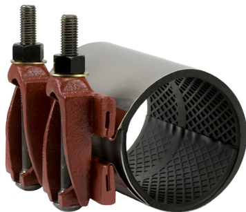
JCM 101 Universal Clamp Coupling Image reflects 6" width

JCM 100 Series Universal Clamp Couplings meet or exceed ANSI/AWWA C230 Standard for Stainless – Steel Full-Encirclement Repair and Service Connection Clamps as applicable.