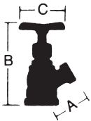
712* BOILER DRAIN (female IPS to hose)