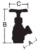
710* BOILER DRAIN (male IPS to hose)