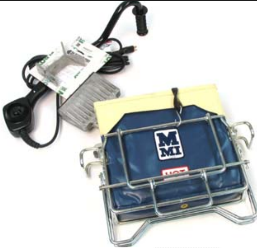
8dips 100-120,50/60,1 htr assy

Part Number: 848709 28 DIPS 100-120V,50/60Hz Heater Assembly