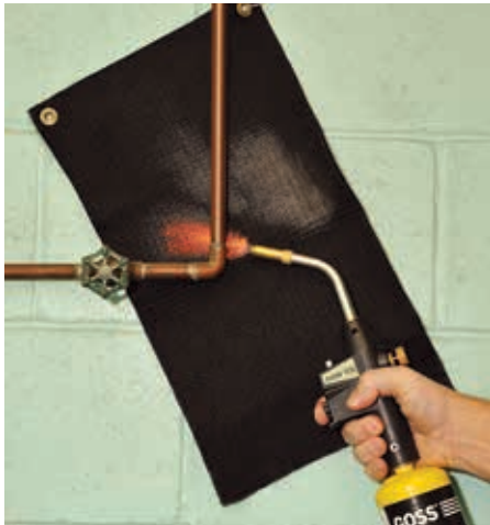
MP-21 Flame Shield Size: 10" x 18"

Asbestos free material helps protect walls, joints and studs from flame and spark damage.