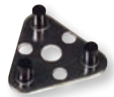
MP-7 Flint Lighter Triple flint.