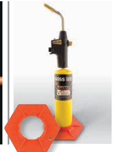
MP-100 Cylinder Holder