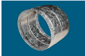
Riveted Flex-Duct Couplings