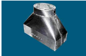
# 651 Register Box w/o Snap-Rail flange