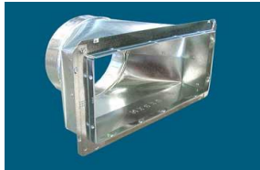
# 601 Register Box w/Snap-Rail Flange