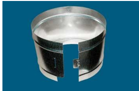
Snap-Together Flex-Duct Couplings