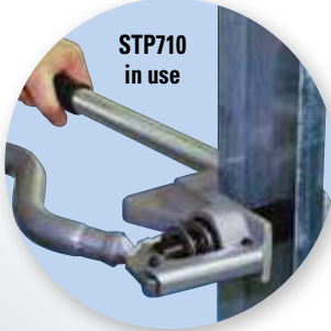
STP710 in use