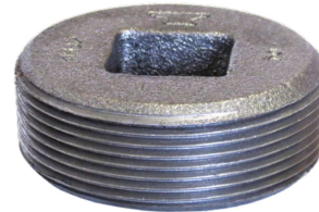
Fig. 390 Square Countersunk Plugs