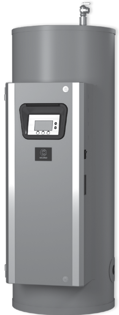
MODELS SSE 5-120 (SSE 100 SHOWN)

Attention: Changes have been made to some models. Please note that this spec sheet refers specifically to models manufactured in McBee, SC