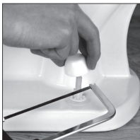
Cut off excess bolt. Snap on bolt cap.