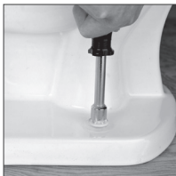
Tighten nut with wrench. (1 to 2 full turns)