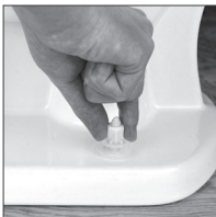
Install over cap washer and hand tighten.