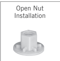
For use with bolt caps. Fits ½" sockets.