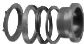
Universal Combo Hub (patent pending)

Water and vapor tight seal. Fits 3" and 4" DWV SCH.40/80 plastic pipe.