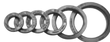
E-Series Inlet or Discharge Hub

Quick installation Built-in "O" rings Water tight Stainless steel clamp