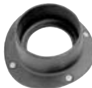
Cast Iron Hub

Fits 2", 3" and 4" DWV SCH.40/80 plastic pipe. Quick installation Water tight