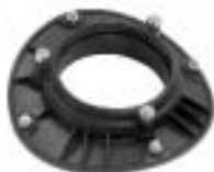
Plastic Pipe Adapters

Water and vapor tight seal with no caulking. Fits DWV SCH.40/80 plastic pipe. Quick installation. Available in 1", 1 1/4", 1 1/2", 2", 3" and 4" diameter.