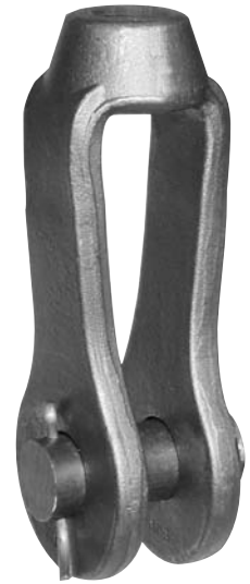
FIG. 299: LOADS (LBS) • WEIGHTS (LBS) • DIMENSIONS (IN)